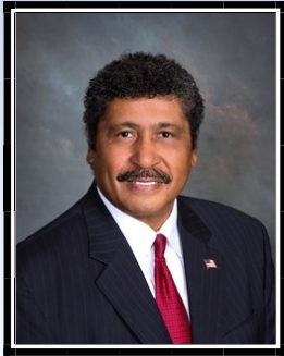
Mayor Fred Pinto